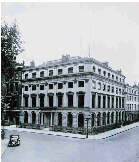
17 Bloomsbury Square in the 1930s

However, in 1927, still expanding, it had seemed likely that the Society would be moving. It bought a block of houses in Brunswick Square, the plan being to demolish them and build a new headquarters and school of pharmacy in its place. The work began in 1935, but stopped at the outbreak of the Second World War. By 1945, the escalating costs of the project meant that the plans had to be reconsidered. The school of pharmacy had become a school of the University of London in 1925, although the Society continued to provide virtually all of its funding. In 1948, the University took over the school completely, and in 1949, they bought the partially completed building. Construction work re-started in 1951, and in 1960, the Queen Mother officially opened the building as the home of the independent School of Pharmacy of the University of London.