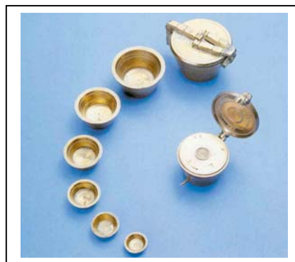
Nesting Weights Museum of the RPSGB

The only capacity measure in the Apothecary system was the liquid grain, the volume of one grain of water, which was introduced in 1885 as a "metric equivalent" but little used.